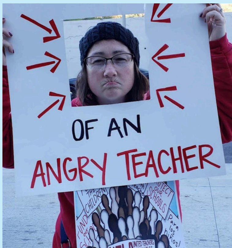
Leading our strike line in 2019