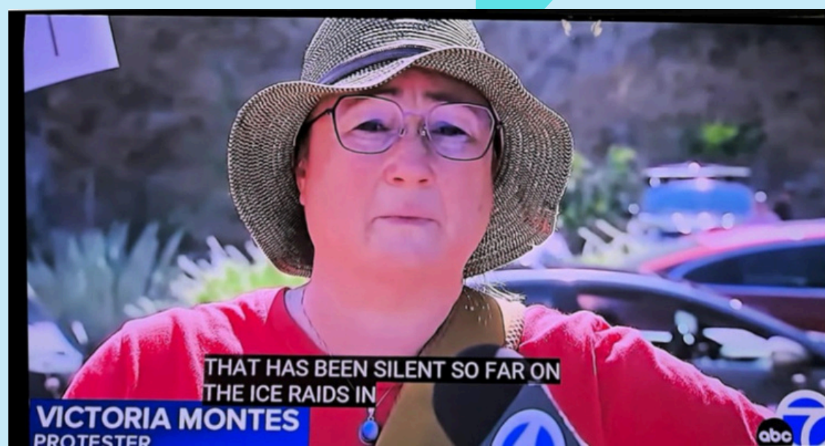
Protesting during our UTLA summer of resistance, defending our immigrant community