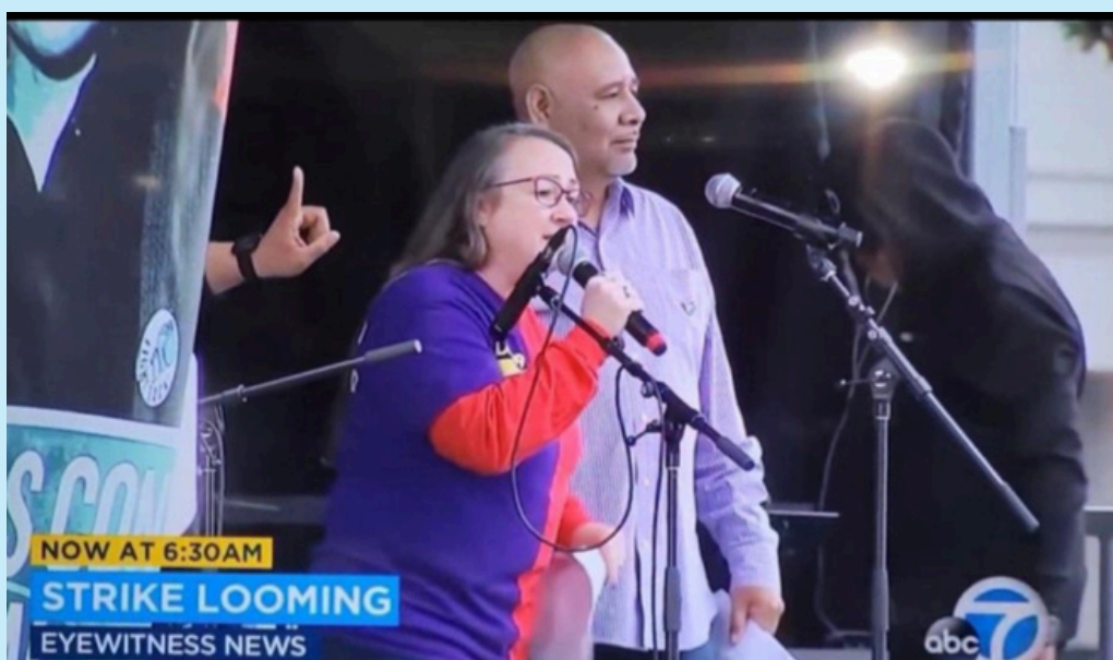
Leading at our 2023 solidarity strike with Local 99