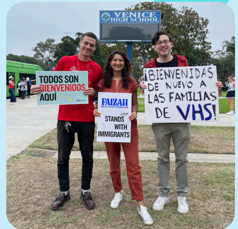
Welcoming immigrant students and families to Venice High School